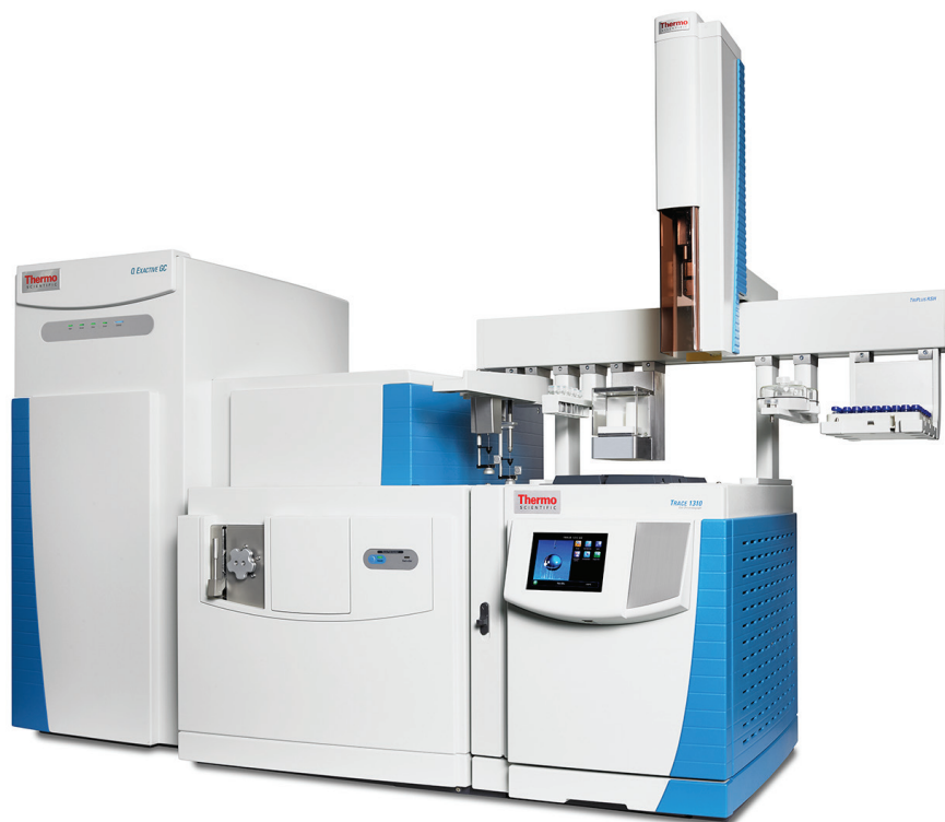
Figure 2. Q Exactive GC mass spectrometer with TriPlus RSH autosampler.