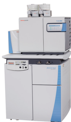
Figure 1. The Thermo Scientific EA IsoLink IRMS System.

Recently, laboratories have suffered from increasing analytical costs due to worldwide reduced availability and higher market prices of helium. In elemental analyzers, used as either standalone instruments for weight % elemental determinations or elemental analyzers coupled to isotope ratio mass spectrometers for isotope ratio determination, helium is traditionally used as a carrier gas in the analytical process and as a reference gas for the Thermal Conductivity Detector (TCD).