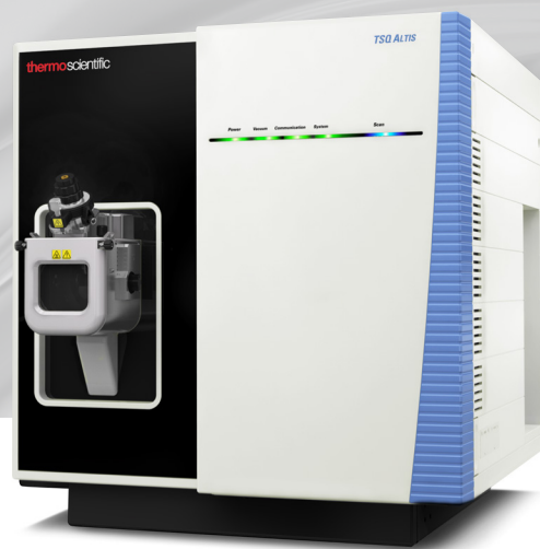
TSQ Altis Triple-Stage Quadrupole Mass Spectrometer