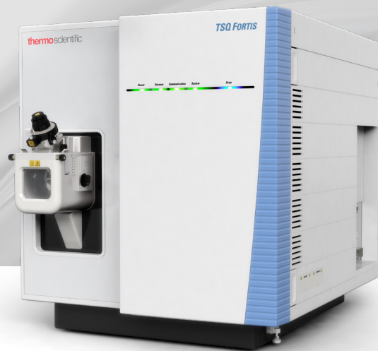
TSQ Fortis triple quadrupole mass spectrometer