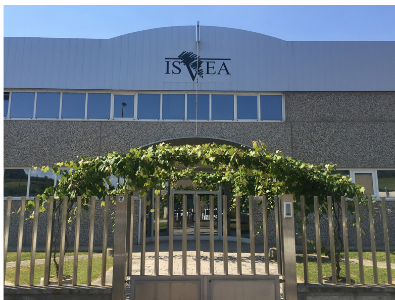
ISVEA srl analytical laboratory, which is highly specialized in wine analysis

ISVEA is a multi-purpose analysis laboratory authorized by the Ministry of Agricultural, Food, and Forestry Policies for the certification of wine and oil and is accredited by ACCREDIA.