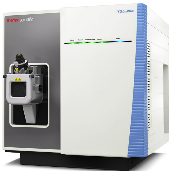
TSQ Quantis triple quadrupole mass spectrometer

Yes, for sure. Today this technique is one of the best to quantify micro-contaminants we already know. This is also its limitation: with this technique it is impossible to search for compounds that were not initially envisioned.